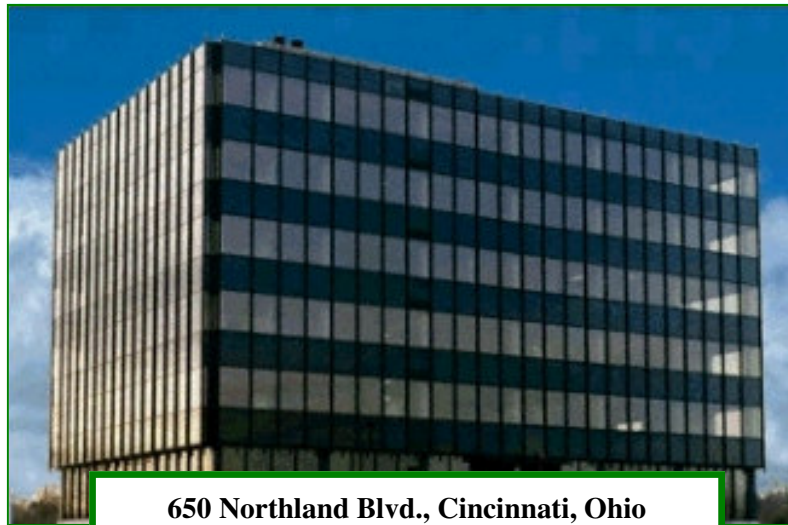
650 Northland Blvd., Cincinnati, Ohio