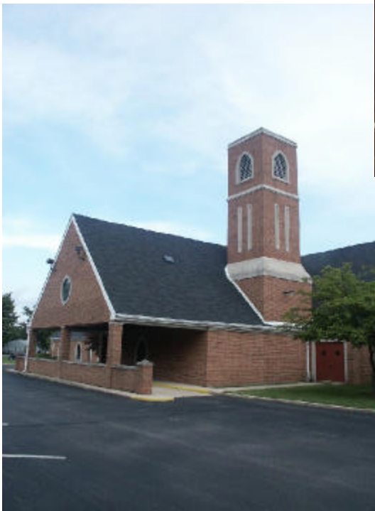
Portico & Bell Tower