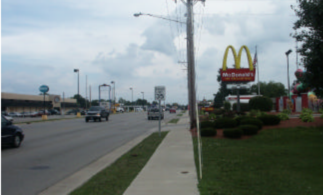
View south on N. Barron from Property