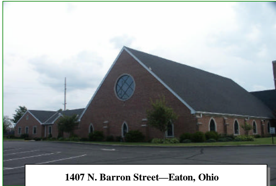
1407 N. Barron Street—Eaton, Ohio