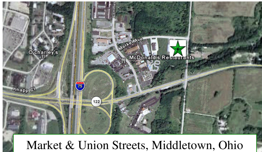
Market & Union Streets, Middletown, Ohio